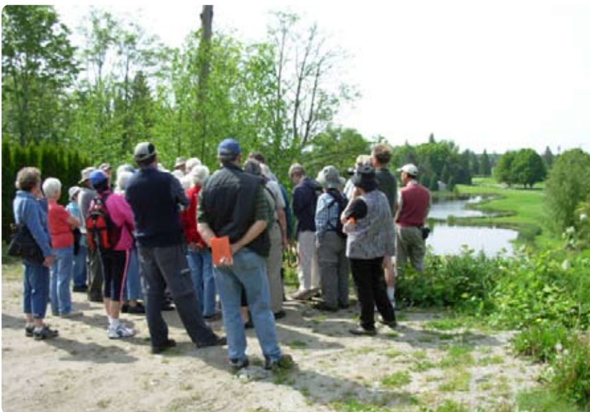
Photo: Bird Walk, 2008; Dunbar Village banners & heron on chimney top (above right)

For more information about Salmonberry Days events or other activities of the DRA, contact: