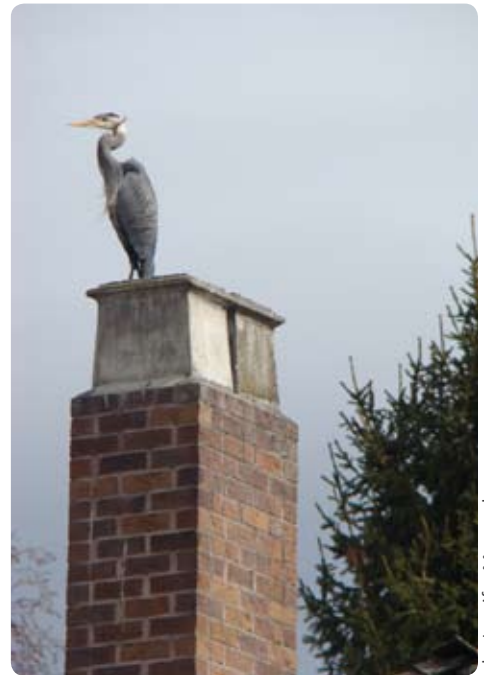
by Jennifer Maynard

The late June Binkert wrote up notes about some of Dunbar's distinctive houses. Read them as you follow four different routes and view the houses from the street. Pick up copies of June's Self-Guided Architecture Tours in the Dunbar Branch Library. Also available online at www.dunbar-vancouver.org .