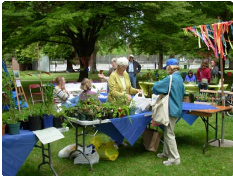
Photo: Salmonberry Days Community Fair, 2008

Meeting place: West Memorial Park (behind the Dunbar Community Centre)